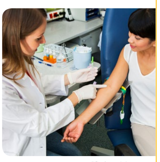
*For qualified participants